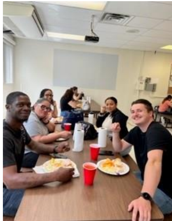
Building A - June Staff Appreciation Lunch