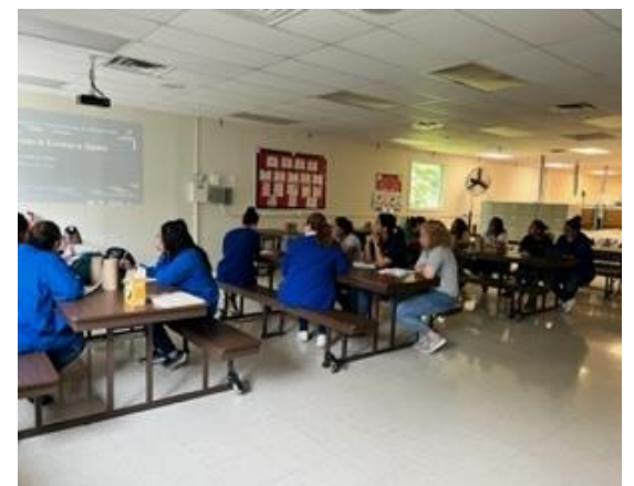
Building A Safety Training