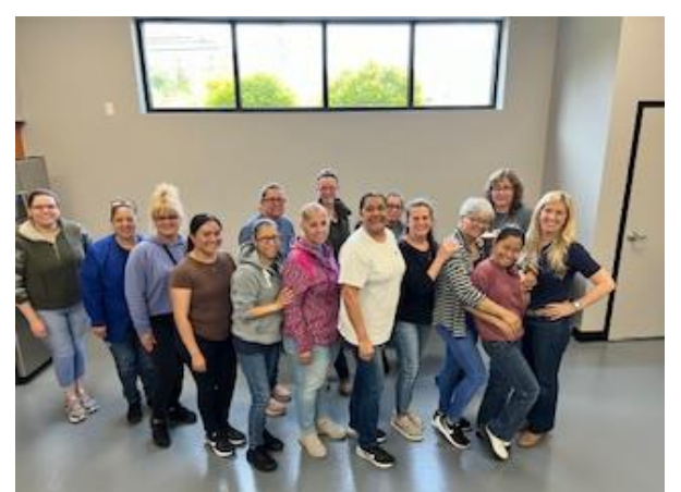
Building B Ladies!

Air conditioning during the warmer months is provided in both buildings for the comfort of all staff.